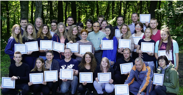
Certified GHN Missions Mobilizers in Ukraine

Register Today at ( www.rlmva.org ) Contact: ghn@rlmva.org / 757-554-0053