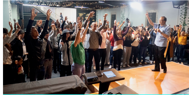
Impartation Prayers for young leaders in Colombia