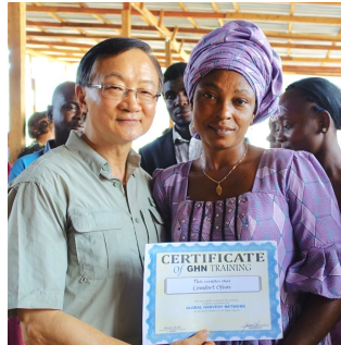
Presenting the GHN certificate